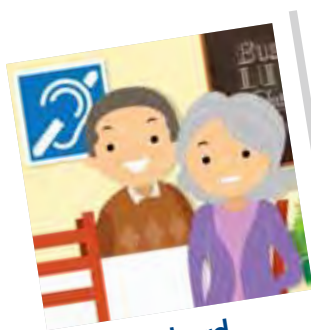
Deaf or hard of hearing